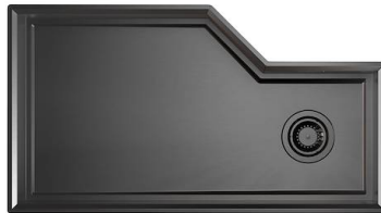
Sink Diade Gun Metal 3028 856